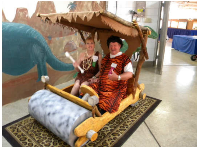
Fred and Wilma this was a very cute display

I would like to put in everyone's pictures but it would make a very large newsletter. I have only put in some of the cases or events. When I get the list of all of the winners of awards I will include it in the newsletter. There were a lot of very nice cases.