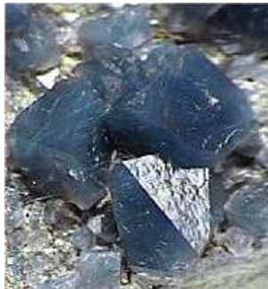
Star Blue Quartz