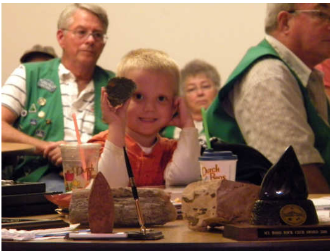
Our Future Rockhounds