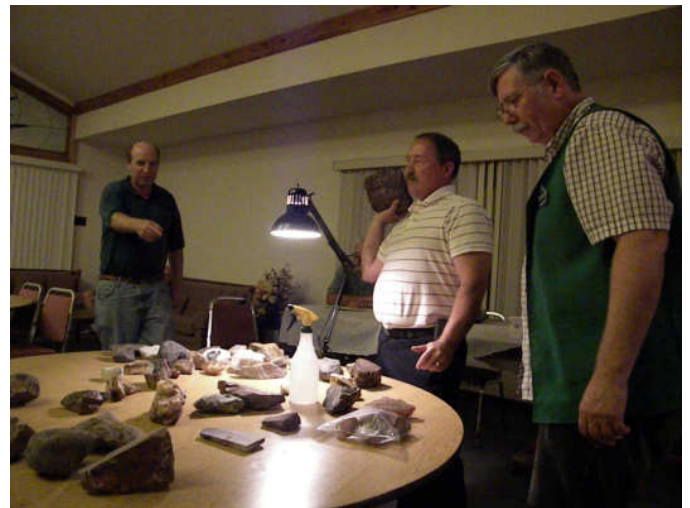
Bidding on rock for Christmas dinner