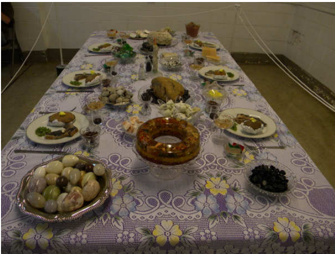
Rock Food Table