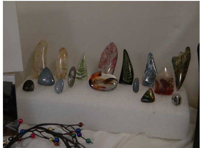
Camp Hancock Students pieces

Honeycomb Calcite is beautiful and impressive form of calcite named exclusively in the state of Utah much like onyx and marble it can provide a colorful replacement for a dramatic accent stone for architectural and artistic applications. The name comes from the remarkable honeycomb appearance when viewing a polished surface. It is formed by the growth of long fibrous tubular cells and crystals of honey color outlined by white membranes surrounding each cell. The coloring is attributed to iron deposits at the time of formation.